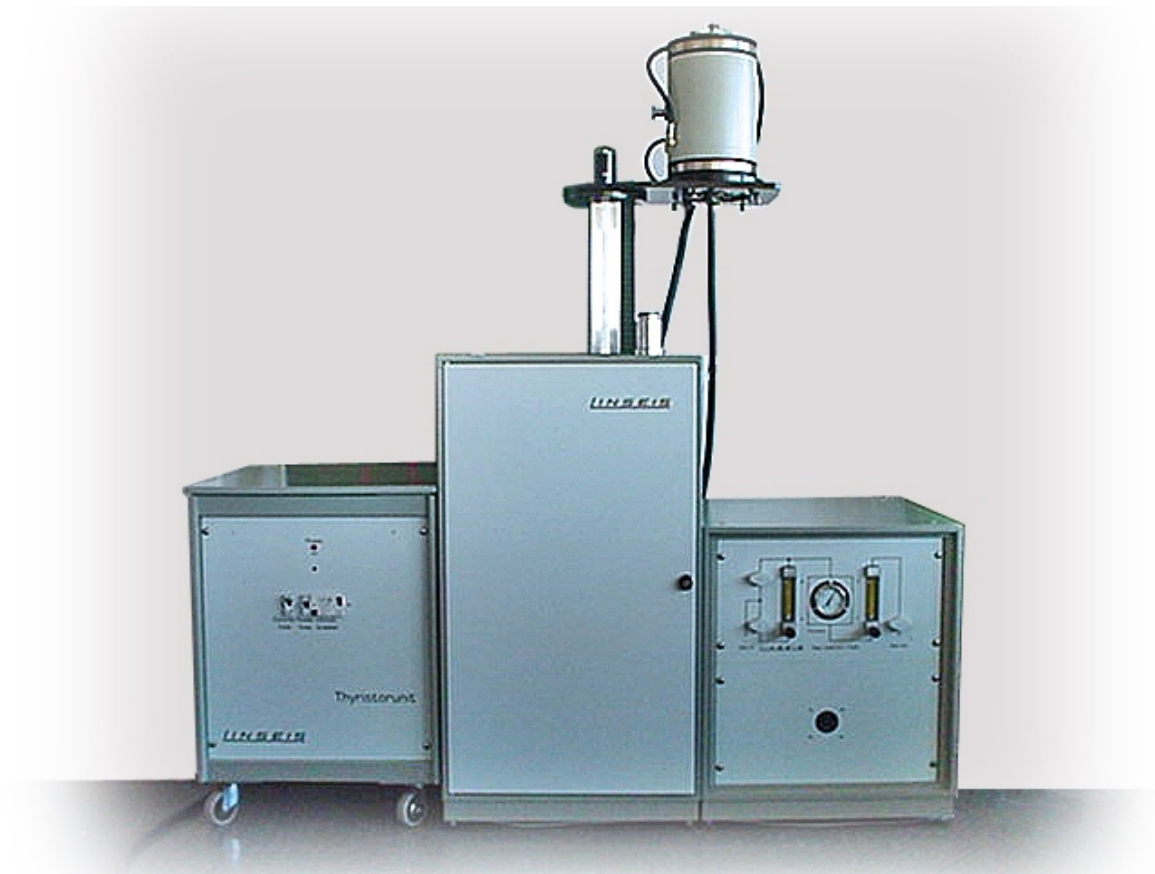
Picture, L81/2400 (Tungsten furnace from RT up to 2400°C under Helium)

The L81 balance system uses a zero deflection / zero balance principle of detection. When a weight change is detected the balance reacts by attempting to move the balance arm. This however is countered by a magnetic force on the balance arm which keeps the balance arm in a zero position.